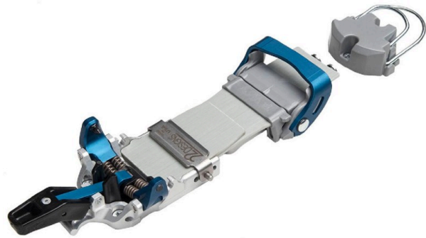
Ex. 4: 22 Designs Lynx Telemark Binding

Alpine/Touring (A/T) tech: These are the relatively new and light A/T bindings with toe pins, not heavier frame bindings where your whole binding pivots up with every step. A/T bindings have a “touring” mode for going uphill and flat, where your boot pivots on two pins that clip into the toe of the boot. When you want to go downhill, you clip the heel in and go into “alpine” mode. Advantages: often the freest pivot for touring (fewest blisters), most control for going downhill, and widest range of boot options. Disadvantages: more expensive than 3-pin telemark bindings.