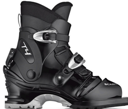
Ex. 2: Scarpa T4 (plastic). Recommended.

NTN Telemark Bindings: Your boots attach to your binding via a plastic “duckbutt” under the ball of the foot. These boots are all plastic (not leather), they will be clearly marked for NTN bindings. NTN systems are absolutely not interchangeable with 3-pin/75 mm telemark systems, but some boots are manufactured in both versions. In other words, you could get a Scott Voodoo for 75 mm or NTN; it would only work with one or the other, but it would look very similar to the casual observer.