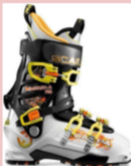
Ex: Scarpa Maestrale RS Randonee