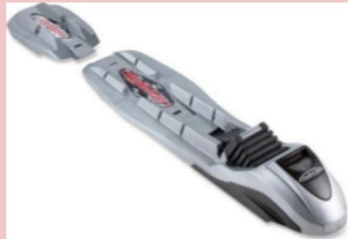
Example: Rottefella T4 Auto Touring