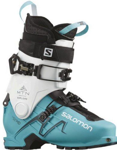
Ex 4. Salomon MTN Explore

Mounting ski bindings: Do your best to find a shop to mount your ski bindings at home. Leave extra time for this task, many ski shops are in their off-season. If you live somewhere without a ski shop, we can get bindings mounted in Juneau for a moderate fee. This is a logistically difficult process and we try to limit the pairs of skis we need to mount during the tight time frame, so please do your best to take care of it before the program starts.