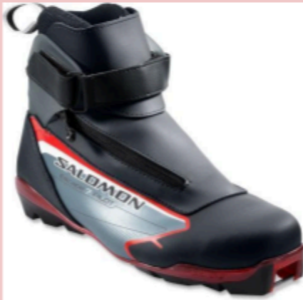
Example: Salomon Escape 7 Pilot CF

NNN and SNS boots and bindings are likewise too fragile for the Juneau Icefield traverse.