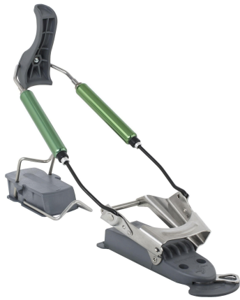
Ex. 3: Voile Switchback X1 Telemark Touring