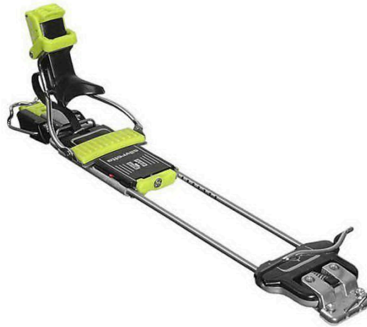
Ex. 6: Silverta Touring

mountaineering boots don't necessarily make for good ski touring boots.. These are especially useful for faculty who are only coming up for a few weeks, own these bindings already, and don't want to buy a new setup.