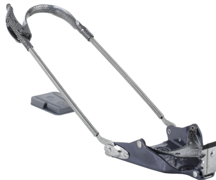
Ex. 2: Voile 3 Pin Cable Telemark (with heel cable)

Telemark Cable or NTN Bindings: These are great if you are excited to try proper telemark skiing on the Icefield. These bindings should be designed for backcountry use and have both an "uphill/touring" and "downhill" mode. Voile and 22 Designs are manufacturers that currently make reliable bindings of this type. G3 and Black Diamond Equipment formerly made bindings in this category, you may be able to find them used. Within this category you can get into 75mm/duckbill (Ex. 3: Voile Switchback) or NTN/duckbutt (Ex. 4: 22D Outlaw or 22D Lynx). The differences between those two are great and better discussed on videochat. Come to office hours!