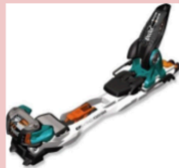
Ex: Marker Duke Randonee