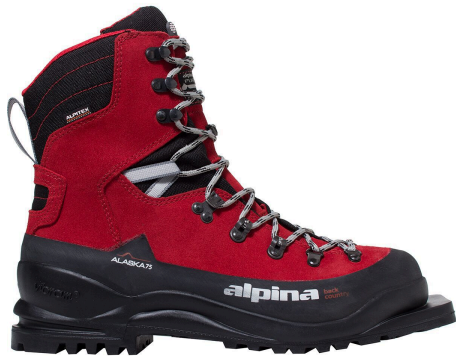
Ex.1: Alpina Alaska 75 mm

soaked through in Icefield conditions (even if they claim waterproofness) and provide less control when skiing downhill. Examples of current soft boots on the market are the Alpina Alaska 75 mm (Ex. 1 below), the Fischer BCX 675 (available new or used), or the Scarpa Wasatch (only available used).