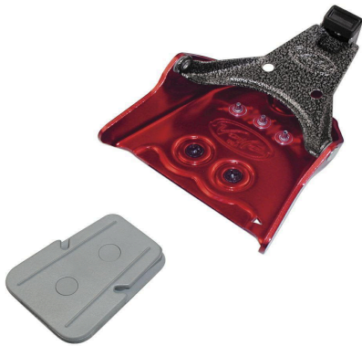
Ex. 1: Voile Mountaineer (no heel cable)

Telemark 3-pin: Medium-duty, standard 75mm/three-pin bindings. We recommend these bindings for novice skiers. They are exceptionally durable, relatively cheap, and size-flexible. The difference between the two is the heel cable that allows for more control going downhill. It's great to have but not required. Note that these bindings have been on the market, largely unchanged, for a couple decades (warning: there were models in 60s/70s that do not work with modern plastic boots). If you can find a used pair that appear to be in good shape, they are probably fine. Note that Ex. 2 is called the "cable" option, but it's not what we're referring to as a "cable binding" below because the boot is attached by the three pins toe clip, not the cable spring tension.