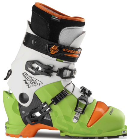
Ex 3. Crispi Shiver

Additionally, there is another class of NTN bindings (unofficially known as NTTN bindings) that uses tech pins for the toe connection, and either a duckbutt or a wire cable heel connection. As aforementioned, if you’re interested, come to office hours and ask!