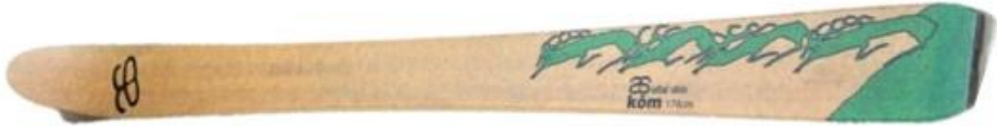
Ex. 3: Altai Kom

Rossignol BC 65 Positrack (even narrower, not recommended for novices)